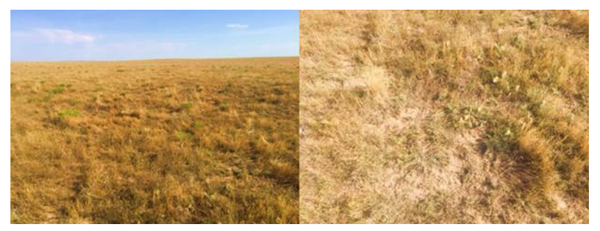
Above : A landscape and close-up view of Hill Tank from Monday.